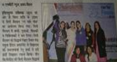
इंदिरापुरम स्कूल में मिनी मैराथन का शुभारंभ किया गया।