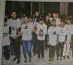
इंदिरापुरम पब्लिक स्कूल में आयोजित मिनी मैराथन में भाग लेने वाले बच्चे।