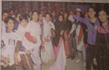
दौड़ में हिस्सा लेने वाले प्रतिभागी।

स्कूल की ओर से परता तथा आवश्यकता अनुसार चिकित्सकीय सुविधाओं का भी प्रबंध किया गया था। दौड़ में शामिल प्रतिभागियों को चार वर्गों में विभाजित किया गया था। सभी वर्गों से आलग-अलग विजेताओं को सम्मानित किया गया। अंत में स्कूल की प्रश्नाचार्या ने भी प्रतिभागियों को सन्तुष्टा किया।